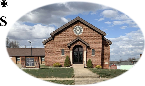
St. Teresa of Avila Cadiz

JULY 5, 2026 14TH SUNDAY IN ORDINARY TIME