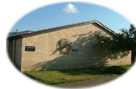
St. Matthias Freeport